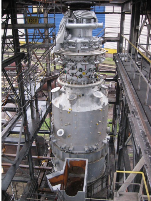
Figure 5 CCF and SRV Shell