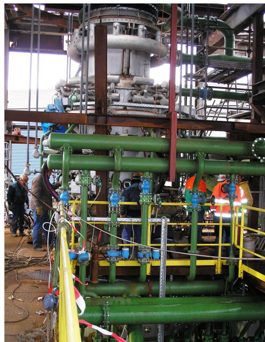
Figure 4 CCF Unit

The CCF unit is shown in Figure 4. It consists of multiple ore/oxygen injectors arranged in such a way that a horizontal swirl motion is achieved. This helps to throw molten ore onto the walls, and from there it is free to run downwards into the SRV.