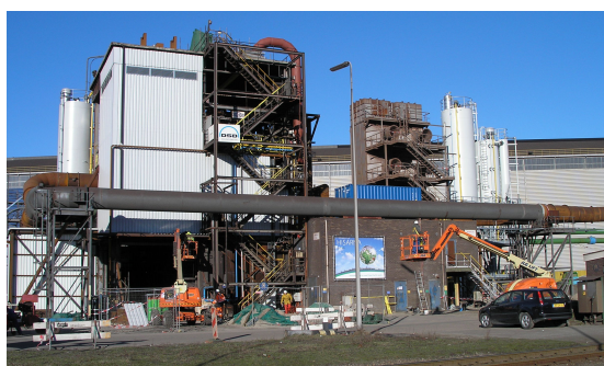
Figure 3 Pilot Plant Overview

Figure 3 shows a general overview of the facility. It has been built within the framework of a former desulphurisation station, and utilises as much existing infrastructure as possible.